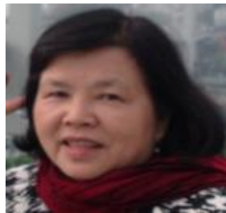
Chairwoman, APDF 2014 Conference Organizing Committee