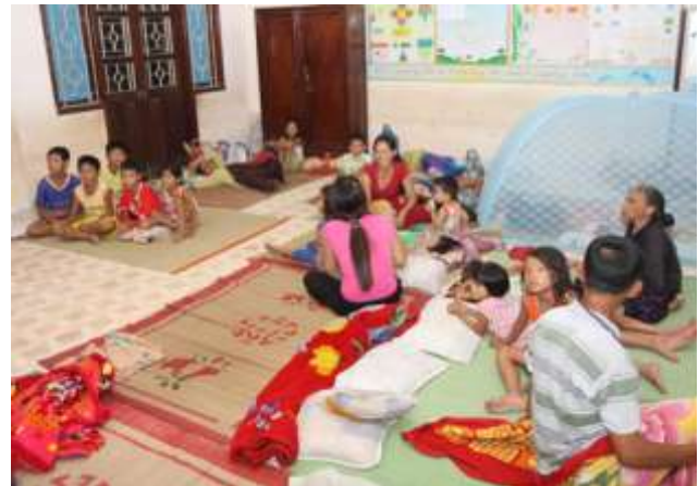
Temporary evacuation site in Gio Linh, Quang Tri