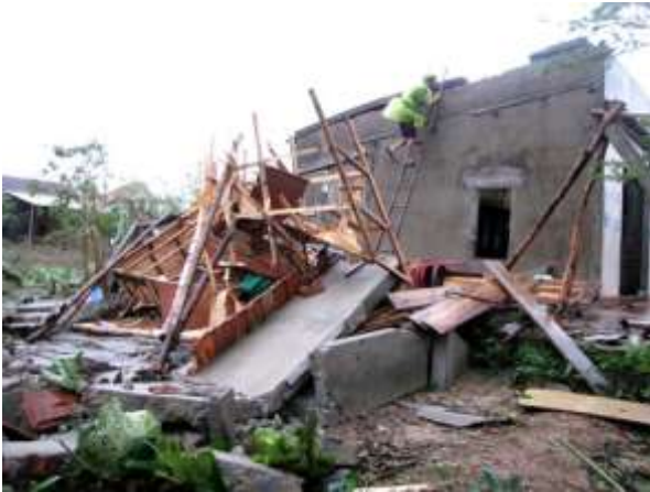
A local house damaged in Quang Binh province