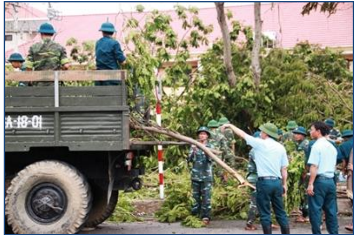
Response in Da Nang province