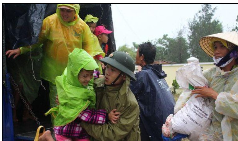
Evacuation of population before the typhoon HaiYan

Preliminary damages caused by Haiyan as reported by the Central Committee for Storm and Flood Control (CCFSC) on 11 November 2013: