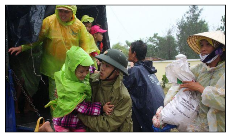
Evacuation of population before the typhoon HaiYan