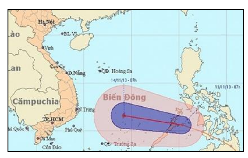
Storm Zoraida as of 13 November

Due to the depression's circulation, the southern East Sea will have rough sea and winds as strong as 74kph and gusts of 989-102kph, starting from noon 13 November.