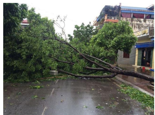
Collapsed trees in Nam Dinh province