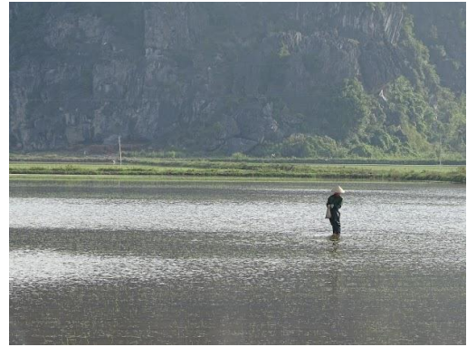
Flooded paddy fields in Tam Coc, Ninh Binh province