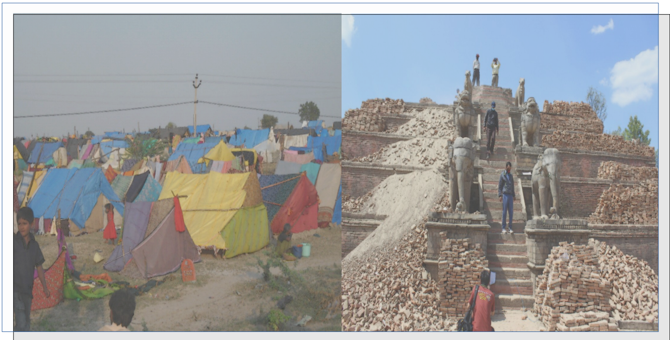
Nepal Earthquake, April, 2015

Conducted entirely by the Tata Institute of Social Sciences (TISS) through MOODLE (Modular Object-Oriented Learning Environment), an online e-learning platform.