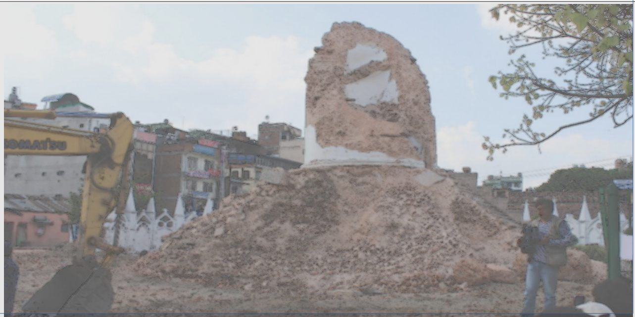
Nepal Earthquake, April 2015