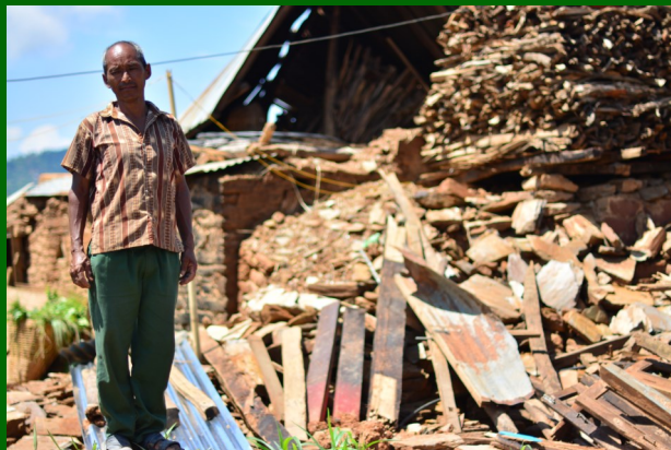
Devastation in Nepal after 2015 earthquake

The Programme also includes an introduction to The World of Red Cross/Red Crescent Societies and a component on Learning to Learn. The month-long Field Practicum / Internship is perhaps the most vital component of the course which brings together all the key theoretical learnings.