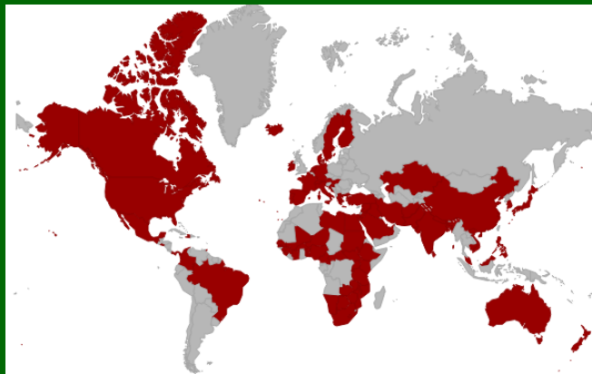
Global Distribution of Participants