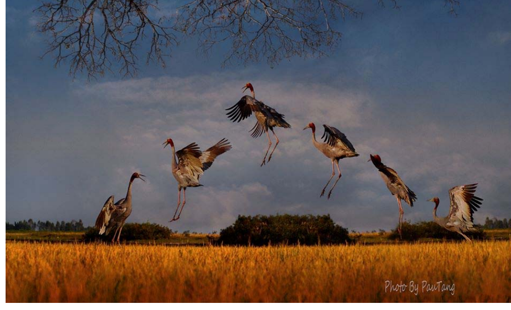
Sarus Crane, an endangered species, at Kien Luong District, Kien Giang Province

photographer, he is wellknown amongst national and international photographers. His photos have received positive feedback and are highly appreciated by photography forums including the vnphoto.net and social networks. The photos show his unconditional love for nature and his passon of wild birds in Vietnam.